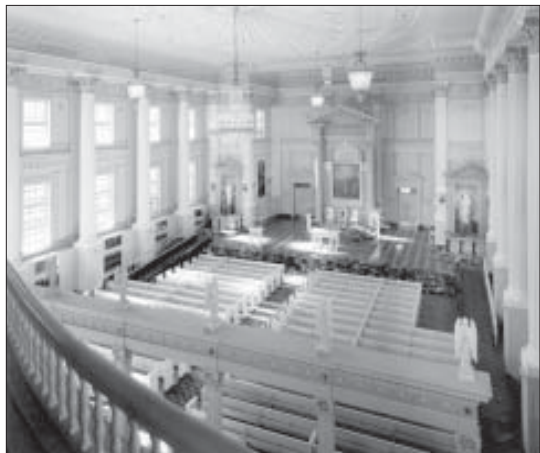
The classical interior of the beautiful Chapel of the Immaculate Conception at the University of St. Mary of the Lake provided the setting for Conference liturgies.

IN LATE OCTOBER OF 2002 the Liturgical Institute hosted its second annual conference on church art and architecture, Building the Church for 2010: Integrating Tradition, Culture, and the Vision of the Second Vatican Council . It brought together participants from a variety of backgrounds to explore factors that must be taken into account in the planning of Catholic liturgical space. Those attending included architects, pastors, artists, students, and liturgical commission members. The conference built on last year's successful examination of the role of continuity and tradition in new Catholic church buildings.