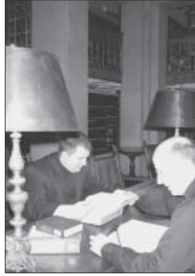
Institute students work on a project in Feehan Memorial Library.