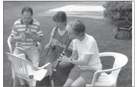
Liturgical Institute students provide an impromptu recorder concert at the July 4 picnic.