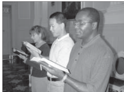
Liturgical Institute students sing Morning Prayer.

As part of the ongoing liturgical exchange between Institute and Seminary intended by Cardinal George, liturgies are shared several times weekly. The University's patronal feast of the Immaculate Conception provided a joyful occasion for collaborative effort in the celebration of Solemn Vespers, well-attended and enthusiastically received by the University community. We hope that such events become a regular feature of our common tradition!